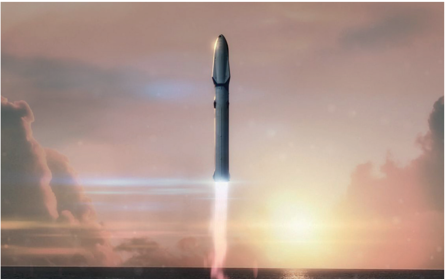
SpaceX Big Falcon Rocket

To be the best connected country in the world in the long-term, it is imperative that the UK has easy access to space.